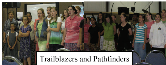
Trailblazers and Pathfinders singing at the auction

This month we were blessed with the opportunity to go to an auction. Some of the funds were donated to our camp, as well as another camp in the area. The girls sang, had dinner and enjoyed experiencing what a real auction is like. Thank you to Foothills Fellowship for planning, organizing, and hosting the event!